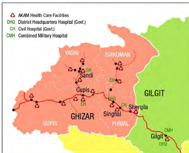
FIGURE 3 - MAP OF GHIZAR DISTRICT

“The fundamental mistake providers made was to equate microinsurance with microcredit. With microcredit, the client walks out with money in her pocket, and you have to trust her. With microinsurance, it’s the other way around.”