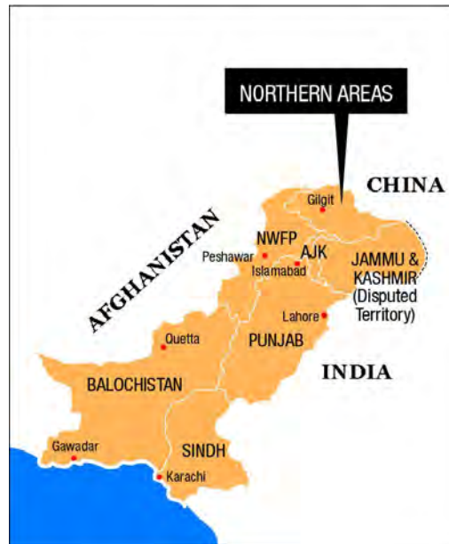
FIGURE 2 - MAPS OF PAKISTAN WITH NORTHERN AREAS HIGHLIGHTED AND THE GHIZAR DISTRICT WITH NORTHERN AREAS INSET

—FROM THE ASSESSMENT OF HEALTH MICROINSURANCE OUTCOMES IN NORTHERN AREAS, PAKISTAN - BASELINE REPORT